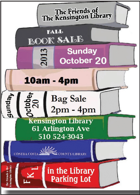
Friends of the Kensington Library Annual Book Sale: Sunday, Oct. 20th, 2-4pm