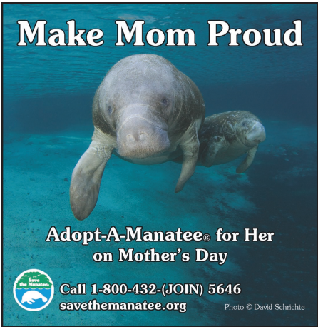
The Perfect Mother's Day gift.