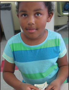
Learning life skills in sewing— the art of hand- stitching.