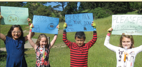
Junior gardeners make “Clean up after your dog” signs for our park.

Reminder: KASEP registration software edits on child's grade. Now is a good time to update your family's account with next year's academic school grade—most impor- tant, current kindergarteners need to be updated to be first graders and third graders need to be updated to be 4th graders. Don't get surprised the night of registration, act now. Logon to your account, edit your child's grade in account information.