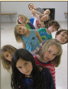
KASEP Creative Drama students.