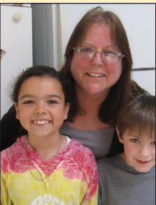
Chocolate éclairs brought smiles to these chocolatier student's stomachs!