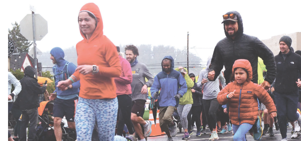
The sixth iteration of the Colusa Circle 5K run brought rain, but that didn't discourage runners of all ages. Pray for sun but come and run (or walk) no matter what.

Benjamin Moore 990 San Pablo Ave. Albany, CA 94706 510-524-6582