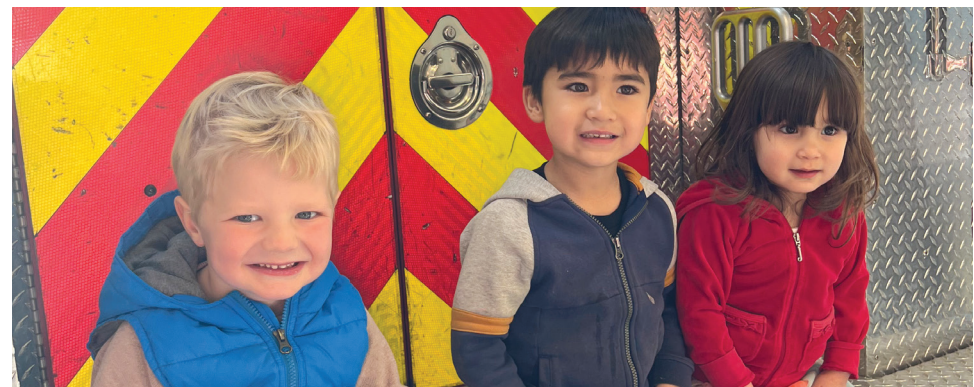
At the Fire Station reopening, three youngsters enjoyed a prime seat on the fire engine's running board.