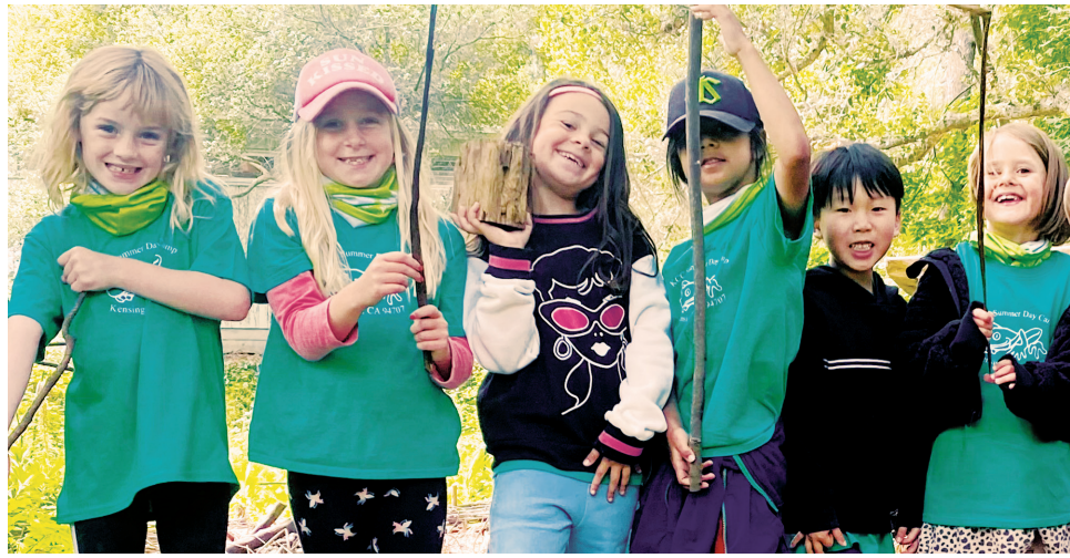
Time to enroll your child for a week or a summer at the KCC Summer Camp. See page 8 for details.