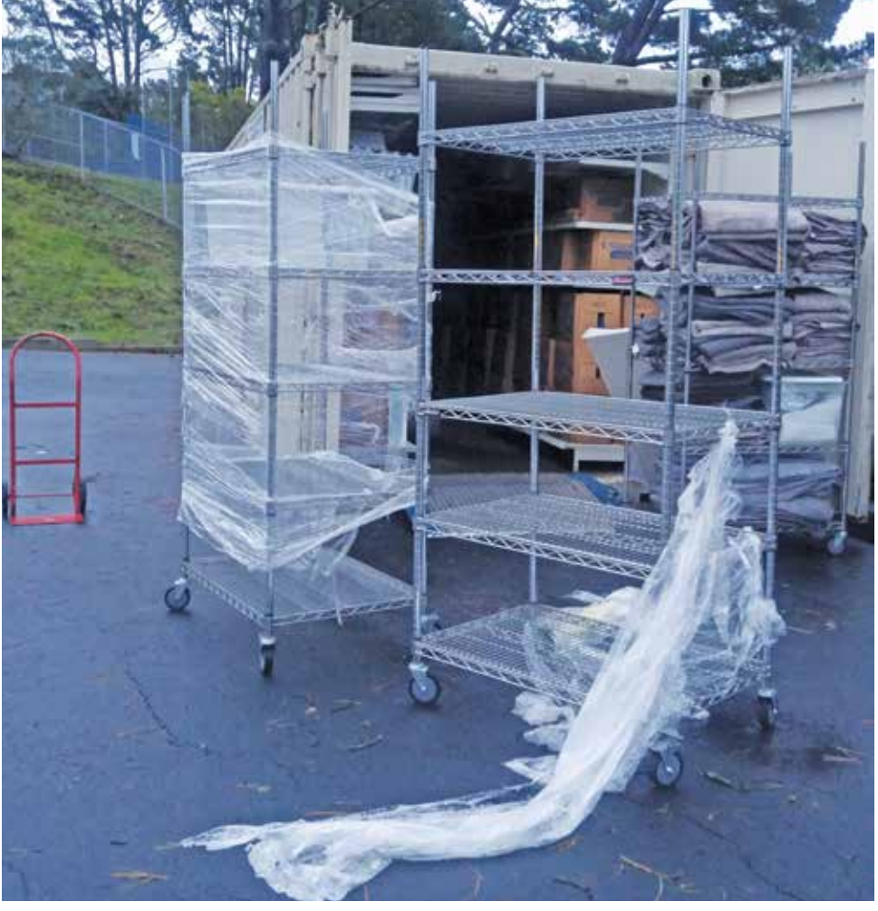
Janitorial staff found the container open on the stormy morning of January 7. Three tall rolling shelves were emptied of contents and other gear was left out in the rain.