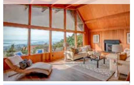
2026 Eunice St, Berkeley