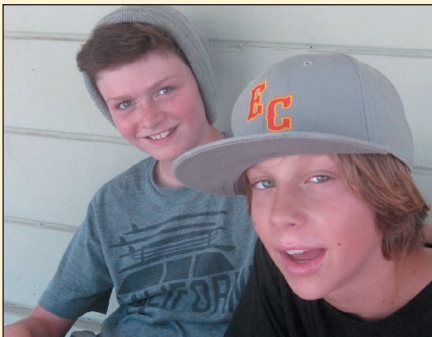
Big guys last year at camp—mighty 6th graders.