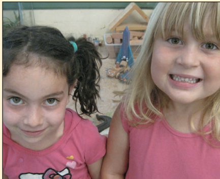
Summer camp—making friends!