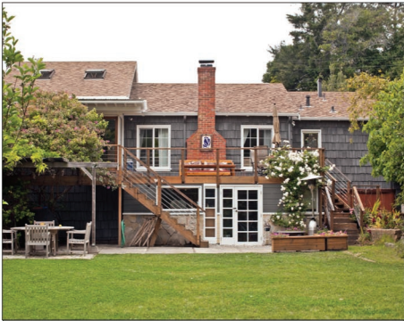
PENDING ~ 83 Norwood Ave 3br/1.5ba on park-like estate

PENDING ~ 204 Arlington Ave, 4br/3ba. Listed at $849,000 PENDING ~ 217 Willamette Ave, 3br/2ba. Listed at $850,000