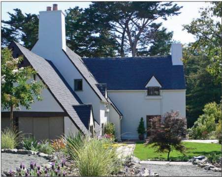
COMING SOON ~ 40 Rincon Rd 4br/2.5ba Tudor

We have dozens more listings available throughout the East Bay. Call for details or to talk about real estate 524.0800.